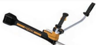
Excelion 2000 Brush Cutter